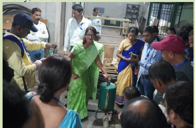
Visit to BCC, demonstration on Bouchery