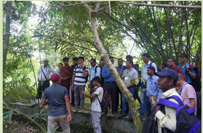
Visit to RFRI Bamboo Nursery, Bambusetum