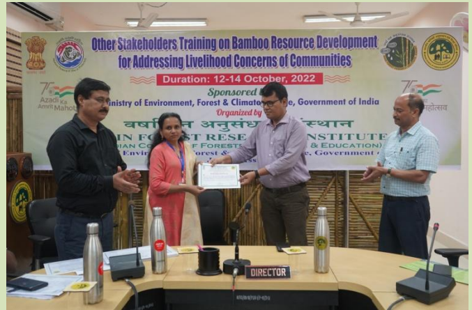
Distribution of Certificates at Valedictory Session