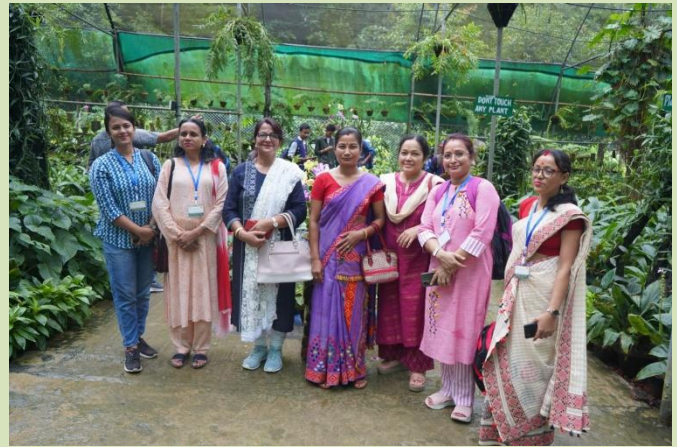
Orchid and Biodiversity Park at Kohora, Golaghat, Assam