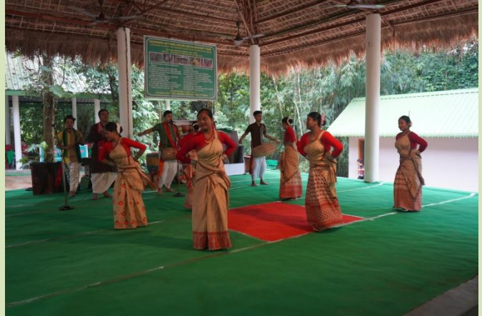
Cultural Show at Orchid & Biodiversity Park