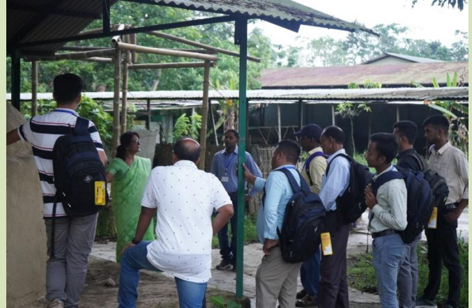
Visit to Bamboo Preservation Unit and Bamboo Charcoal Unit