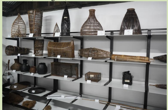
Bamboo Museum at Orchid and Biodiversity Park