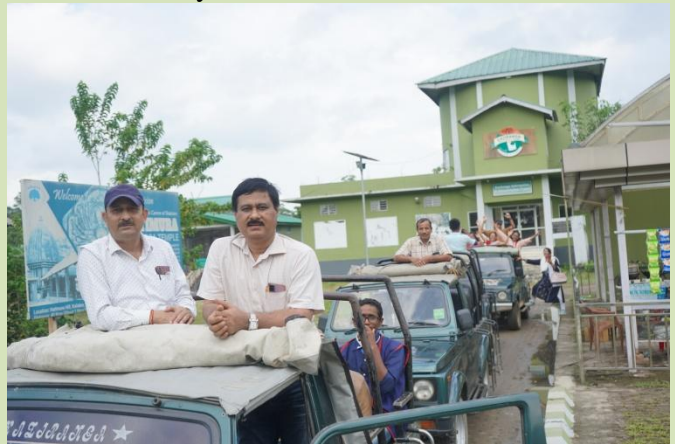
KNP Visit by Jeep